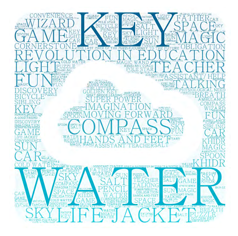
Figure 1. The word cloud consists of metaphors produced by teacher candidates about technology-assisted instruction in special education

Water, key, and compass are the most commonly used metaphors by teacher candidates, as shown in Figure 1. The metaphor most frequently used by teacher candidates is "water," which is the most basic requirement for life to continue.