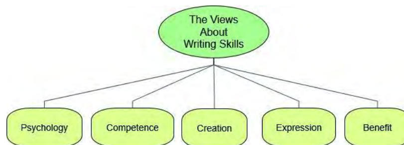
Figure 2: Categories regarding the views about writing skills

The prospective teachers' views about their writing skills were split into five main categories: psychology, competence, creation, expression and benefit. These categories are presented in Figure 2.