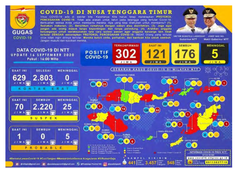
Figure 1: The trend of increasing Covid-19 cases in NTT as of September 14, 2020 (nttprov.go.id)

In Sikka Regency, one of the districts in NTT Province and located in the central part of Flores Island, the impact of the Covid-19 Pandemic has also been felt by the community in various fields of life. The pandemic has taken away freedom of activity, whether working, studying, or other activities that support people's lives. In the field of education, schools are closed for an uncertain period of time in accordance with the advice of the Task Force for the Acceleration of Handling the Covid-19 Pandemic. The high number of positive confirmed cases of Covid-19 in the NTT region in general and in the Sikka Regency area in particular is a serious threat to the implementation of education and teaching in schools.