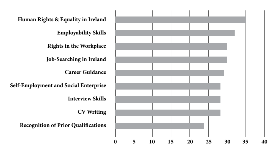
Table 1. Responses to the question 'Which of the following workshop topics might interest you?' (Please tick as many of the following as you wish). Total of 44 responses received.