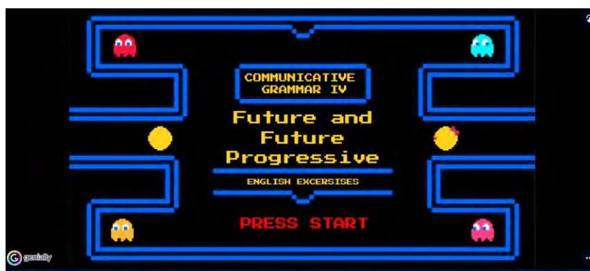
Figure 2. Genially Game Sample