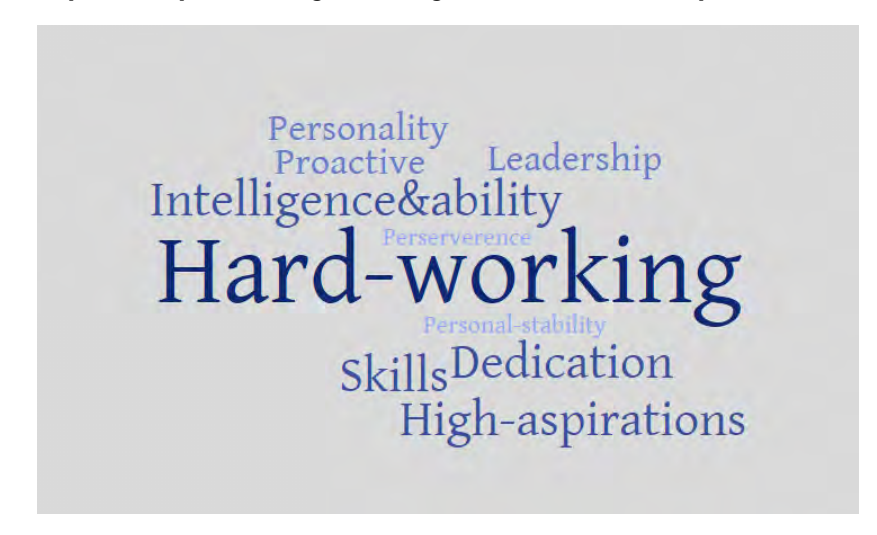
Figure 2. Word-cloud of perceived qualities of high-achieving students drawn from respondents' comments