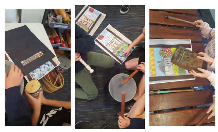
Students work in groups to create soundscapes based on their artwork. Figure 1:

The group work that followed built on this model and was eventually shaped into a coherent series of soundscapes which were recorded and played to accompany the exhibition of their art.