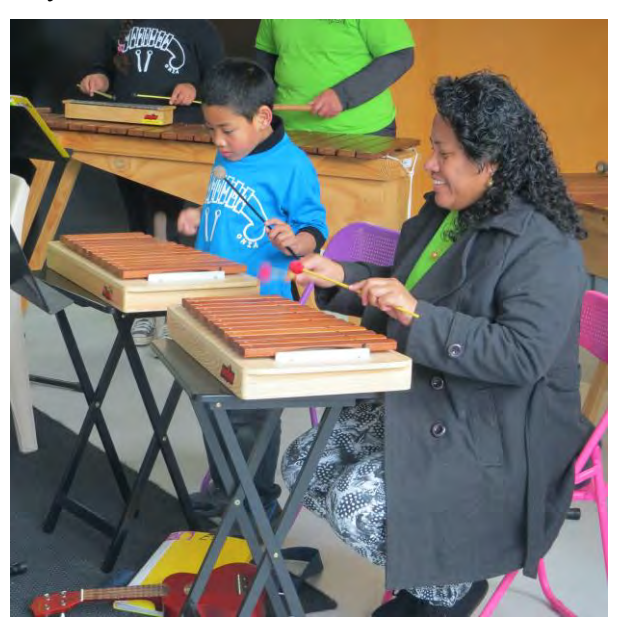
Figure 3: Family Marimba Group performing at the Marimba Festival.

A few years ago, when I was teaching in a culturally diverse school, where families were very supportive of their children's music learning but had limited financial resources, I took the initiative to start a family marimba group. The premise of the group was that students could attend if they had an adult family member with them. We started off learning some familiar songs and marimba pieces, then moved on to creating our own pieces. The composition work followed Orff-based processes, similar to what I would have used in my classes.