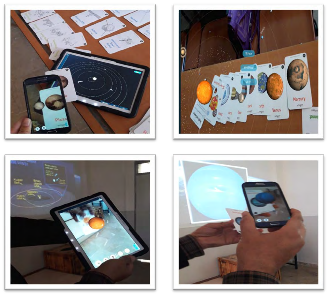
Figure 1. Sample images for the application process of the experimental group

their textbooks, listening to the instructor and participating the activities just when questions are directed to them. Sample images for the AR application can be found in Figure 1.