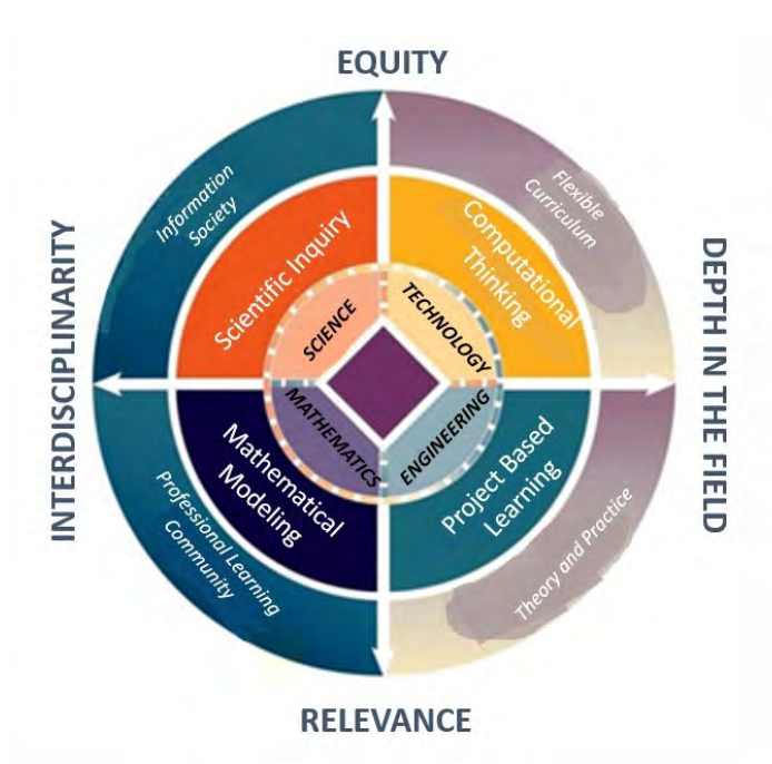
Figure 2. STEM: Integrated Teaching Framework (Corlu, 2021).

These four basic skills, which take part in the transdisciplinary role of technology, are important because of the fact that they are necessary when seeking answers to the current real-life problems of the 21st century and they can be highly linked with each other due to their high interconnectedness. The transdisciplinary role of technology serves for a skill- and creativity-based understanding far beyond disciplinary understanding. It adopts learning environments that consider and reveal 21st century skills. Encouraging students for STEM participation is a necessity not only to prepare students for future STEM careers, but also to equip students with 21st century competencies in general (Honey et al., 2014). While the four key skills in the transdisciplinary role of technology provide a rich process that unearths 21st century skills, current skills need to be followed and consciously included in the process to reveal the transdisciplinary role.