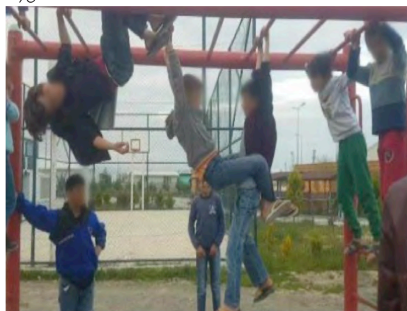
Children Playing with Sports Equipment in the Playground