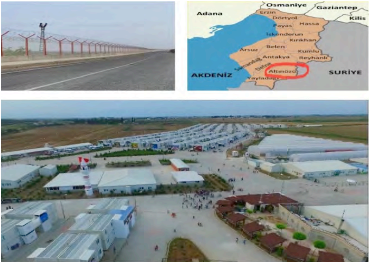
Hatay Provincial Borders Map, Road Route and Temporary Accommodation Centre ( http-1 )