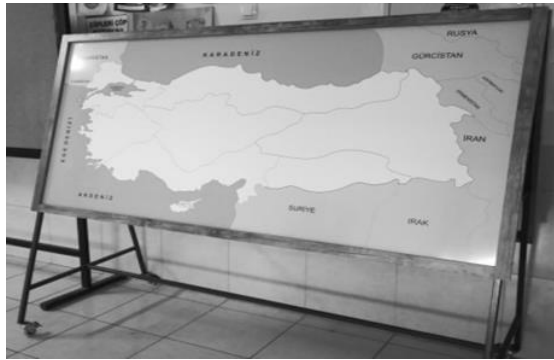
Figure 1. Front part of the material: regions and neighboring countries