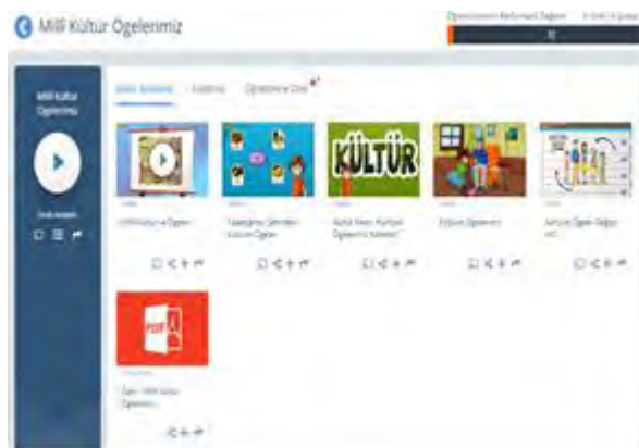
Figure 6. A Screen shot of EBA program