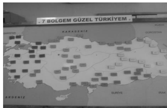
Figure 3. Regions and provinces in the same color