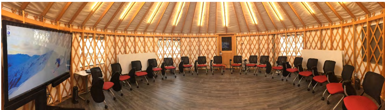
Figure 2 The Teaching Lab Yurt

Coast Mountain College (2017, October). Introducing ‘The Teaching Lab’ in COLTs Yurt Classroom. https://tinyurl.com/yurt-classroom . Copyright by Coast Mountain College.