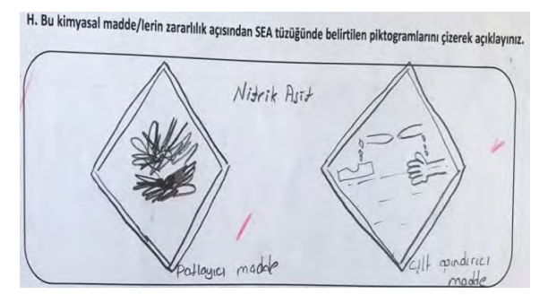
(Example of 3<sup>rd</sup> case, PT-20)