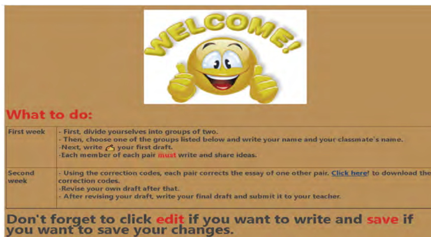
Figure 2. Screenshot of wiki page

The researcher asked each pair of participants to collaboratively write a review of a film or book in the form of an essay (introduction, body, and conclusion). The teacher of the participating students’ English class chose the topic, and the essay-writing task was, in fact, part of a classroom project that the students would, at the end of the experiment, have to submit to the teacher for actual grading. The teacher had taught the students in advance how to write a book or film review, and had provided them what each part of such an essay must contain.