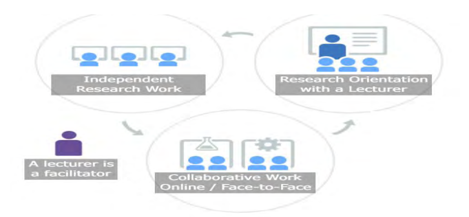
Fig.3: Enriched BLM for research-based courses – adapted from (B.L.U., 2021)

This step allows for offering a blend of online and face-to-face instruction in which a proportion of the course content is delivered online whereas other parts are delivered through face-to-face meetings. As explained by Horn & Staker (2011), blended learning approaches do not eliminate the need for teacher guidance and face-to-face instruction. Instead, they enable students to learn "at least in part in a supervised brick-and-mortar location away from home and at least in part through online delivery with some element of student control over time, place, path and/or pace" (p. 3). Having regular