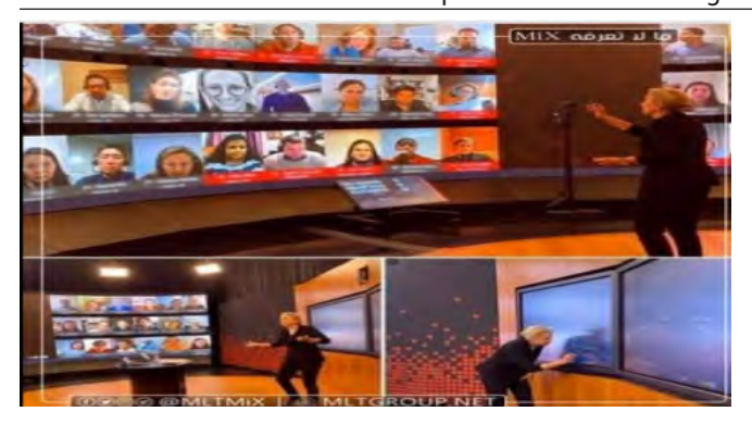
Fig. 4: Teaching in a smart lab (BLM, 2021)

of time and place they have. Colleges and universities should create virtual, smart classes in which classroom walls are covered with cinema screens for instructors and lecturers to interact with students. This model is a simulation of real classes since students can interact with each other and with their teachers very smoothly. Since all classes will be virtual, class timing can be adjusted to fit most students and all exams can be conducted online, while the instructor monitors students. Plagiarism and cheating technologies like Respondus Lockdown Browser can also be activated. Figure 4 shows an example of a virtual smart classroom.