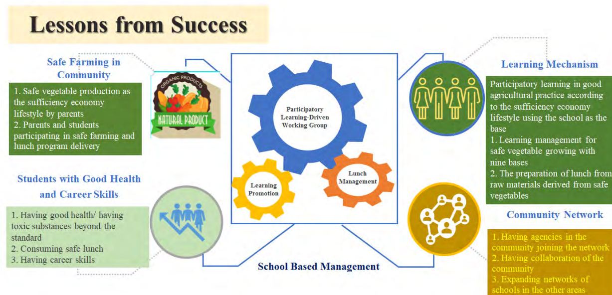
Figure 2. Lessons from Success

According to the input from the students' health problems at Ban Pong Yaeng Nai School, it can be concluded that the solution must be taken urgently. The method used is school-based management. Participatory learning—the driven working group is an important driving mechanism in the school's operation. It is the development of nine learning bases from Kindergarten One to Grade Six for students to learn through project-based learning. In the community is a network of cooperation between parents and local authorities to grow safe vegetables in preparing lunches for students and general consumption and distribution. Key findings include systematic management of problems occurring within the community, adjusting a new concept (Mindset), creating an understanding of all parties involved, setting clear goals together to create concrete cooperation, causing the solutions to students' health problems, and having a positive effect on various fields development such as knowledge and career skills of students. The outcome in the community is parents and community leaders focusing on growing vegetables safer, enabling people in the community to receive safe food at every meal.