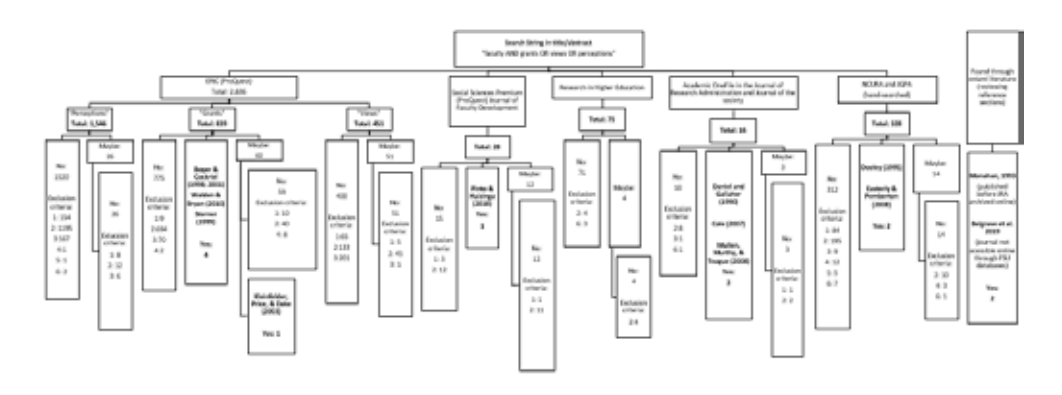
Figure 2. Search Flowchart: Total of 13 Included Articles in Current Review

The systematic search, as depicted in Figure 2, used the following Boolean combinations: faculty AND grants, faculty AND perceptions, and faculty AND views. A university librarian was consulted for databases and journals most relevant to this research topic. The databases searched were ERIC (Proquest) (n=2,911), Social Sciences Premium (Proquest) in the Journal of Faculty Development (n=36) and Research in Higher Education (n=88), and Academic One-File in the Journal of the Society of Research Administration (JSRA) (n=8) and the Journal of Research Administration (formally JSRA) (n=13). All results were imported into a citation manager (Ref Works) and filtered for duplicates (n=104).