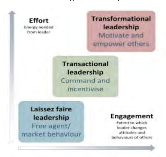
Figure 1 Avolio and Bass Full-Range Leadership Model

mixed-method study concluded that transformational and transactional leaders are likelier to change their leadership methods to enhance student achievement. Although laissez-faire leaders were in their position the longest, he stated they were more resistant to change, hindering progress.