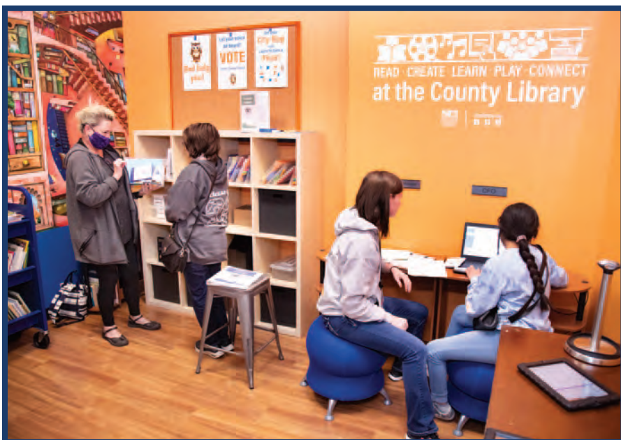
Left, below, and right: As a result of the COVID-19 pandemic, more options for and acceptance of online teaching and learning emerged.

(Lockee, 2021). For USD, the online department's influence helped campus teachers pivot to online learning in two days. Teachers developed online content and changed their teaching to meet the needs of students who were suddenly no longer in their classrooms. Due to the unique school situations during this time, USD educational interpreters were able to devote time to translation work for USD teachers, such as voiceover work for ASL videos and translating textbooks into ASL. This planned time to work on these efforts continues post-pandemic.