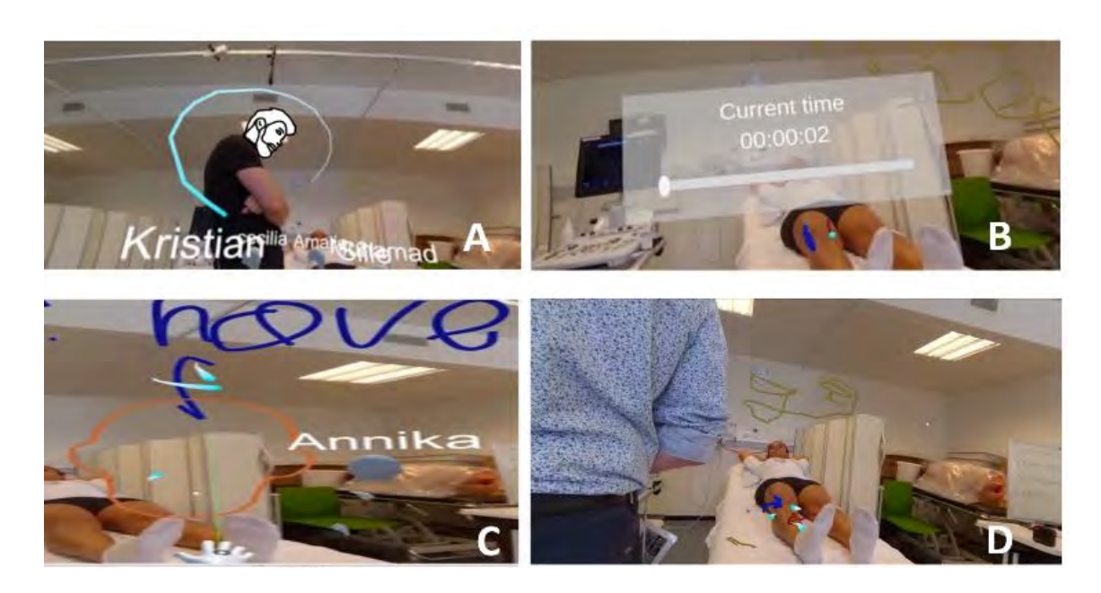
Figure 3. Screenshots of (A) students pointing and (B, D) drawing using CAVA360°VR and (C) writing.

Inside 360VR, the students used the various tools provided by the software to identify and define the problems occurring in the video and to structure their learning in the 360VR environment. The students frequently used the laser point to mark specific objects as relevant for each other (see Figure 3). The students also used the drawing tool to highlight and "freeze" these markings, for example drawing an arrow to indicate the motion in which the student pulled the knee. The drawing tool was also used for taking notes in 360VR (this proved troublesome for some due to the smoothing feature of the draw tool). A second strategy was to rewind the video which allowed the students to repeat sections of the video to further enhance their understanding of the procedures of the various tests.