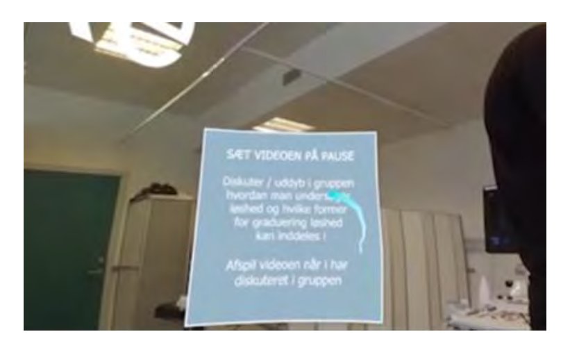
Figure 4. Scripted question.

In test 3, one of the students had several prompts appearing in front of her in 360VR (see Figure 4). These prompts guided the students to reflect on and discuss the information given to them in the training video. The students afterwards explained that it had a positive effect on them and helped them to understand what was going on in the training video. Only one of the students was prompted with the questions and the four other students were dependent on the fifth student to communicate the questions and the fifth had another responsibility in session compared to the others.