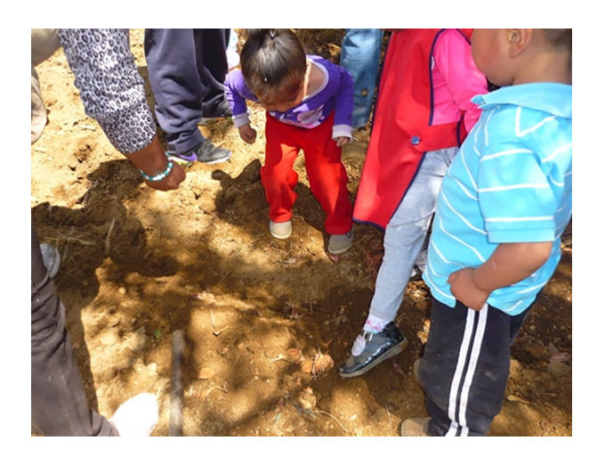
Photovoice 2. Each person has a role in contributing.

In the activity pictured above, four people participate: the teacher distributes the seeds, the youngest girl places the seeds in the hole by the furrow, and the older girl covers the seeds with earth by using her left foot. Each person has their unique role while observing others simultaneously.