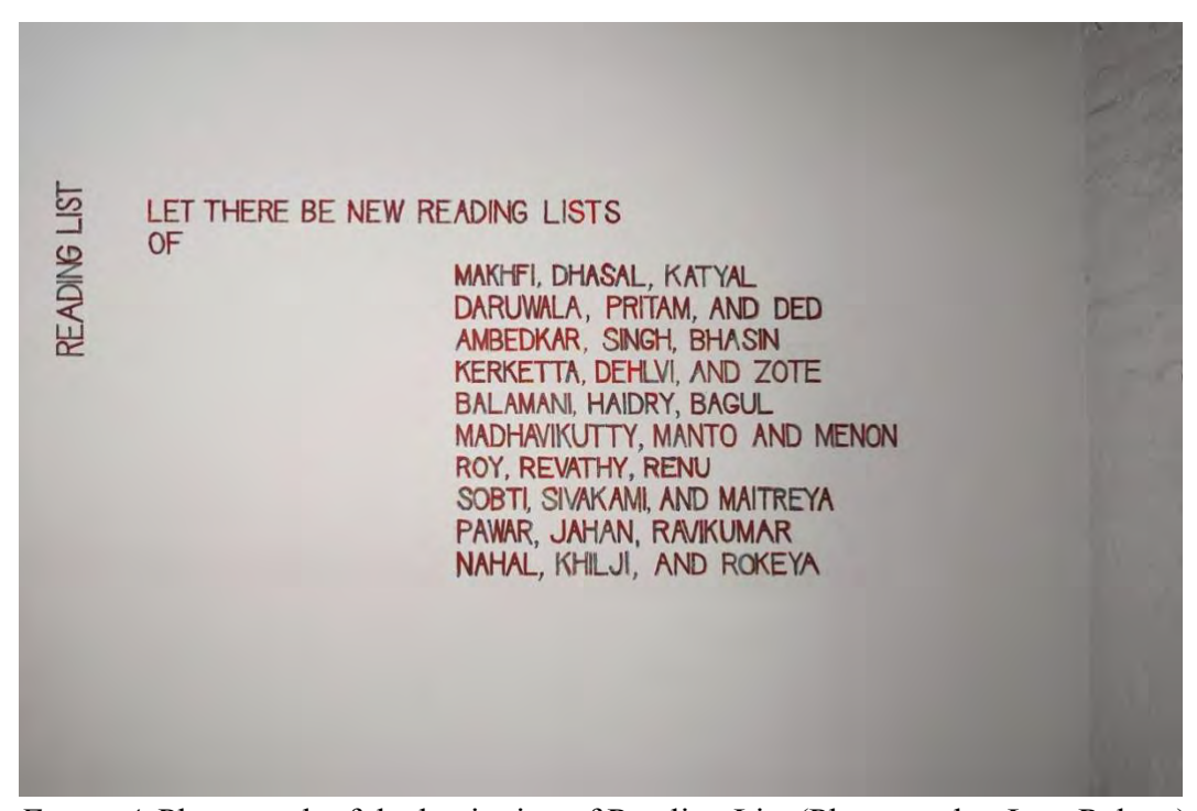
Figure 4. Photograph of the beginning of Reading List

When you describe all this, to me it's like not just about the right to write. It's about the right to exist.