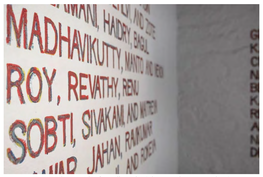
Figure 5: Photograph of Reading List

For me, it is a resistance towards this understanding of hierarchy and knowledge and knowledge systems. Vidha Saumya