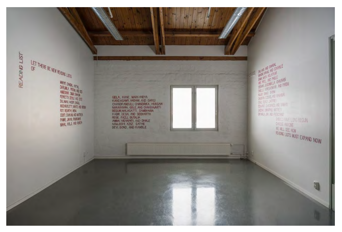
Figure 1. Photograph of Reading List