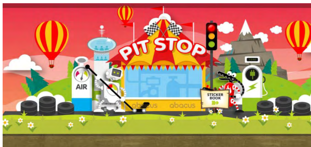
Figure 4. Reward system