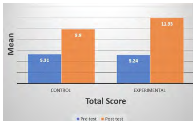
Figure 1. Students' overall mean total score in pre- & post-test

2013, p. 7). As was stated earlier, the effect size (Cohen's d ) was 1.12 which is considered to be large according to the benchmarks suggested by Cohen (Kraft, 2020).