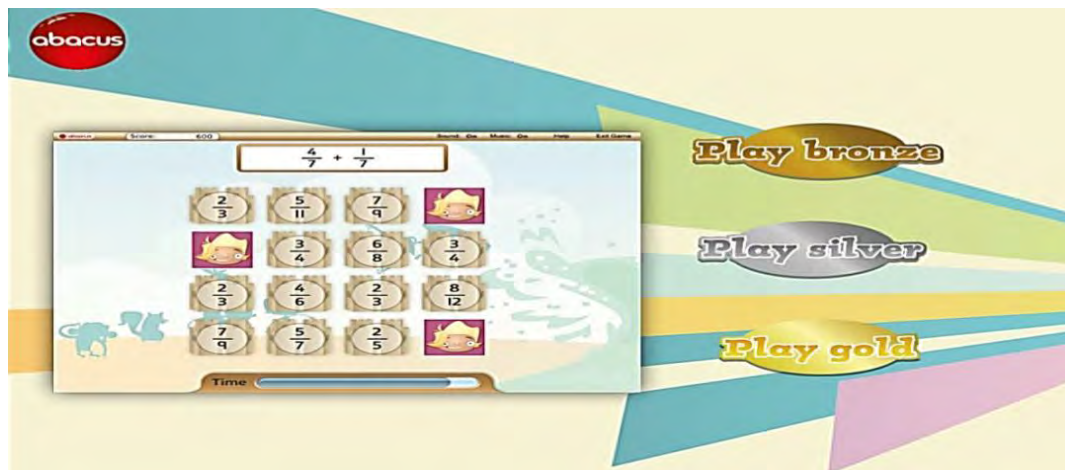
Figure 2. Game three levels

conducting the study, teachers observed how students were excited to practice more fraction problems by finishing the three differentiated levels in each fraction game to gain more points and therefore earn more rewards. Using ABACUS active learning provided the students with different levels to solve fraction problem starting with the bronze level, the silver level then the gold level where they can see the questions are becoming increasingly difficult with each level, but they are acquiring more points which enhanced in the learning process. This was obvious for the mathematics teachers when they observed that the students were eager to solve the assigned games with all the levels (bronze, silver, and gold) as mentioned in Figure 2.