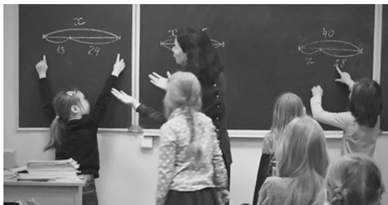
Figure 2. The teacher signals “I don’t understand.” Some of the students give an explanation and the teacher signals that she does not understand by lifting her shoulder and holding out her hands in a questioning gesture as she says: “Can that be?” or “Is this right?”

in the drawings. Using what can be seen as an imaginary playful format she then asks students to examine the structure in more detail: “You know, one boy from another class said one thing... He said that he thinks that two drawings are much more similar to each other than the third one. Which one is different?” During this sequence, several students come to the board simultaneously – all engage in explaining and arguing. Some students work together with the teacher, and some work in pairs (Figure 2).