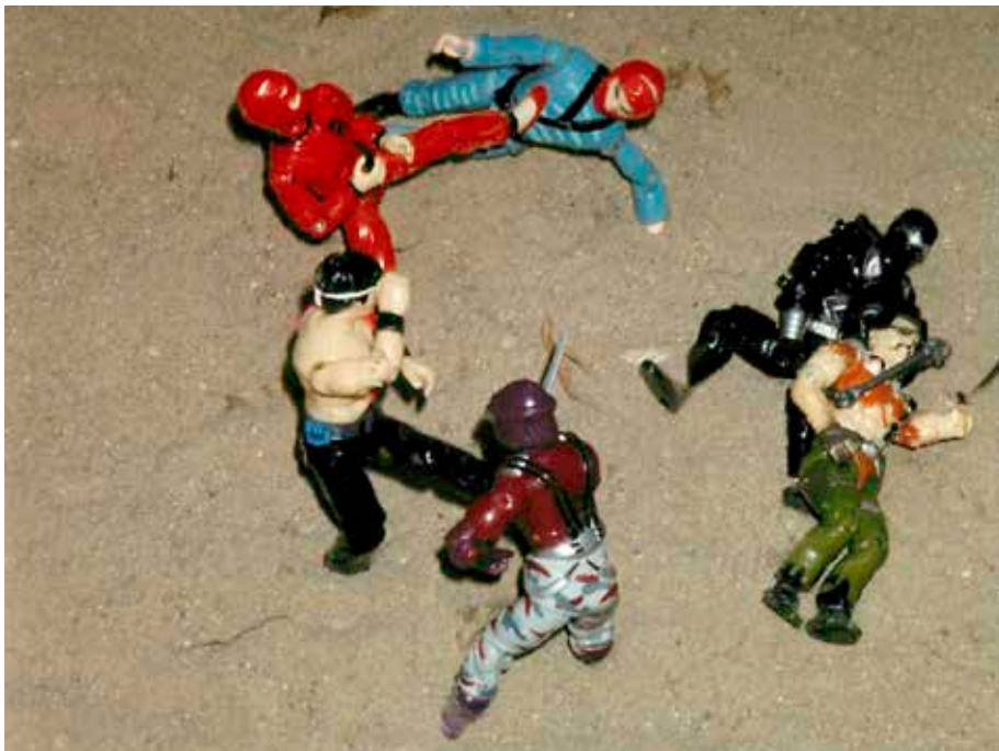
Figures 2 and 3. Photographs of G.I. Joe versus Cobra combat. Taken by the author in the mid-to-late 1990s. Figure 2. Left to right: Dusty, Roadblock, Gung Ho, Rock 'n Roll, Blowtorch (actually a figure called Mercer whom I substituted for Blowtorch), Range Viper, Iron Grenadier, Destro, Cobra Commander (actually a figure called Duke whom I helmeted and turned into the enemy leader). Figure 3. Clockwise, starting with the fellow missing a shirt: Quick Kick, Jinx, nameless enemy ninja, Snake Eyes, Zanzibar, Night Creeper.