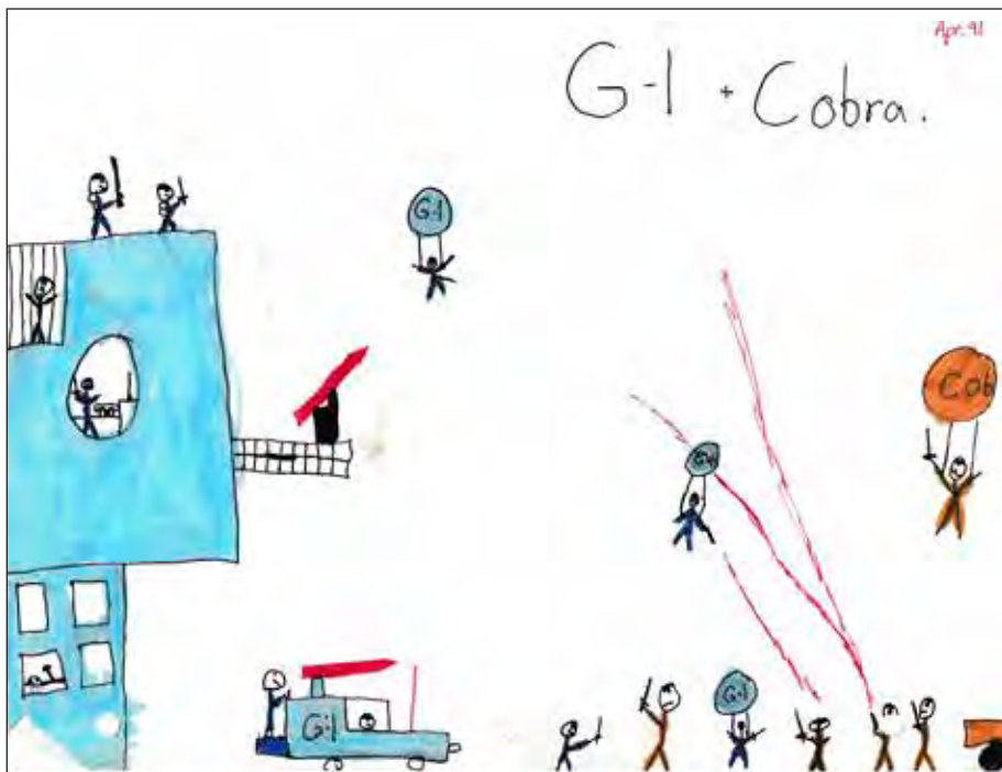
Figure 4. G.I. Joe + Cobra. Drawing by author, April 1991.

I also wonder if the violence I enacted in play was a way of coping with the violence that I witnessed in my life as a TCK. That violence included the beginnings of a political rebellion in the Casamance, which Momar Diop (2003)