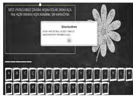
Öğrenme etkinliğindeki çiçeğimizi koparmayalım oyunu