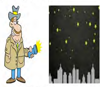
Öğrenme etkinliğindeki ışık kaynaklarına örnek