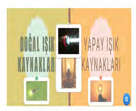
Öğrenme etkinliğindeki eşleştirme oyunu