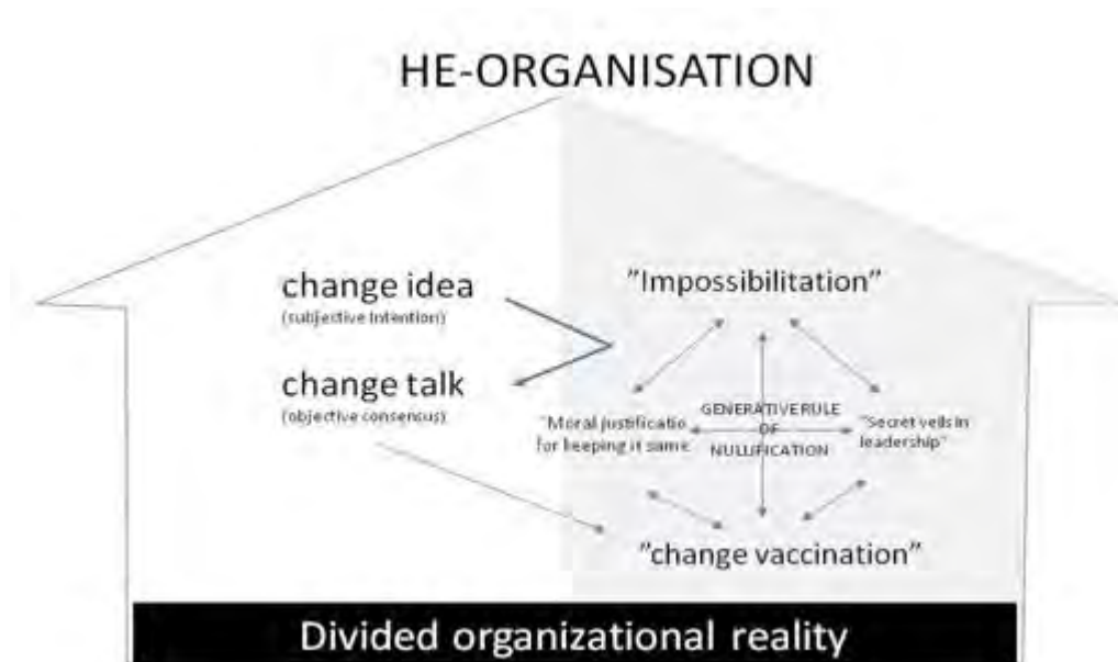
Figure 2. HE Teachers' Social Grammars. (Karjalainen & Nissilä, 2011)

The analysis was aided by the usage of the meaning matrix which was developed for revealing meaning structures in a written text (Appendix 1, Table 1; Karjalainen & Nissilä, 2011). It focuses on the meaning structures, either objective or subjective, either historical or universal, as well as their consciousness or unconsciousness (latent nature). (Karjalainen & Nissilä, 2011) The deep analyses concentrated on the possible organizational and personal development and change in HE. An in-depth example of an interpretative process explaining how a step-by-step process can be reconstrued and show different levels of individual meaning is given in Appendix 2. An overview of meaning structures concerning teachers' social grammar is given in Figure 2.