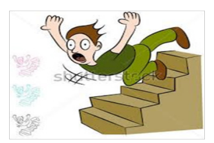
Figure 1 Sample Question in the Test

In addition, the rubric for scoring the related question is given as an example below.