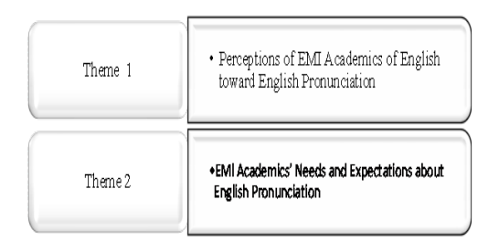
Figure 1 Themes for Interviews

The first theme consists of EMI academics' perceptions toward the significance of English pronunciation and its place in EMI classrooms. Two categories are included in this theme which are defined as "the value of pronunciation in EMI implementation" and "students' profiles".