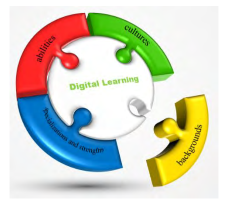
Figure 1. Digital Learning - New possibilities

Educational teams must rethink the appropriate pedagogical approach and the use of innovative technologies in ways for teaching and skills development. Developing meaningful learning environments requires team effort based on collaborations between academia and the community of teachers and curriculum developers (Mayo, 2020). The combination of digital learning diversity opens every educational institution to different worlds and cultures. Diversity of opportunities have been created for students with a wide range of different abilities, different cultures, different backgrounds, specializations and strengths. The post-pandemic world will need new ways of learning and communication (Passantino, 2021).