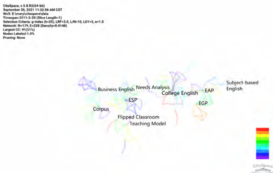
Figure 2. Visualization of Keywords (Analyzed by CiteSpace)

In this study, the retrieved original data are directed to CiteSpace analysis software, one of the mainstream software of knowledge domain visualization, and the research progress and frontier hot spots are searched through keywords and cluster analysis. The time-slicing is set as “from 2011 to 2020”, the year per slice is “1”, and “keyword” is chosen in Node Types. “Top 50 per slice” is chosen for analysis. The result of the visualization can be seen in Figure 2.