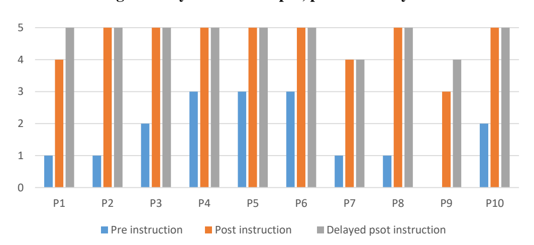
Figure .1: syllabification: pre, post and delayed

In order to limit them by allowing them to focus on a particular group of words, they were then given classifications such as fruits or sport teams. The aim here was to write as many words as possible within the given category with the proper number of syllables. They were then timed for three minutes and no points were given if syllables were miscounted. This activity was repeated throughout the intervention period because the participants enjoyed the activity. Figure 1 shows their performance: pre, post and delayed .