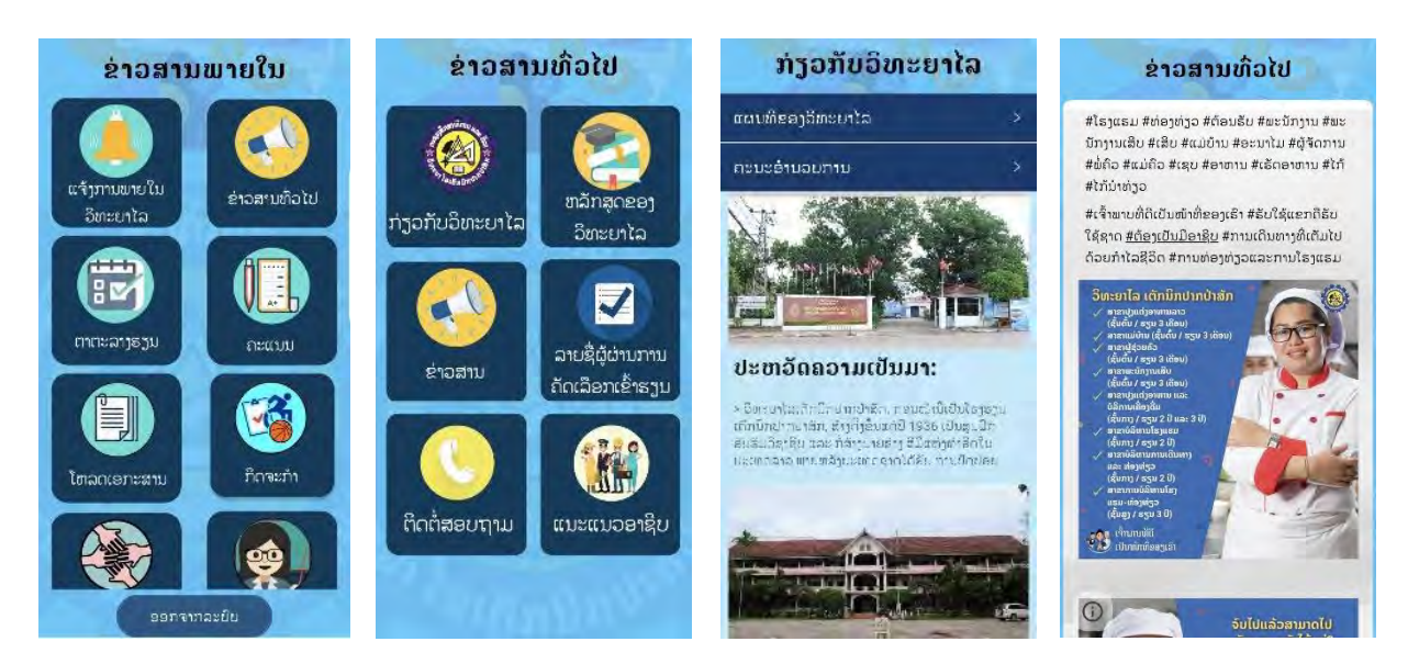
Figure 4. The PPSTC system

Figure 4 shows the PPSTC system, which supports three user groups. (1) Administration system is a system for the administrator who can manage the information of both internal and external users, courses, public information, and data. The administration system has three submenus consisting of Manage courses menu, Manage public information menu, and Manage data user menu. (2) Internal user system is a system for students, personnel, and teachers in the college. They are able to manage personal information and view public information and data. The internal user system has eight