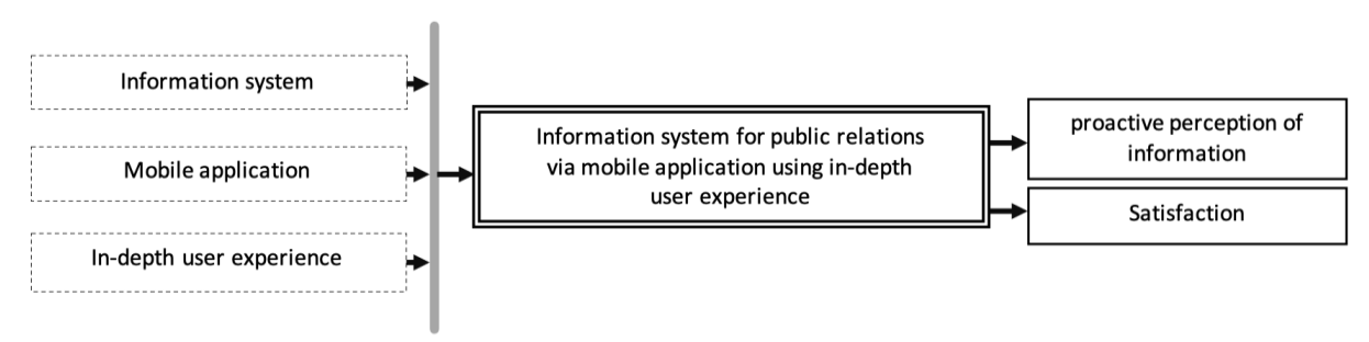
Figure 1. Conceptual framework of the PPSTC system

In this section, the researchers studied the theories and other researches related to information system (Tivawong, 2012; Thanyasiri & Prinyokul, 2020), mobile application (Karapakdee et al., 2016), user experience design (Ta-oun & Junthotai, 2007; Jawdat et al., 2011), proactive perception of information (Jularlark et al., 2021), and satisfaction. The conceptual framework is shown in detail in Figure 1.