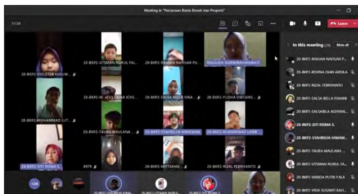
Figure 1. Zoom Media for Synchronous Learning

Learning also takes place synchronously. Synchronous learning is done using video conferencing with Zoom Meeting. This online meeting is very useful for teachers and students, in addition to conveying material that needs direct explanation, as well as a means of getting to know each other. Zoom has an impact on increasing student performance in independent study, managing time, and increasing motivation (Fuady et al., 2021), (Syaharuddina et al., 2021). On average, students who join Zoom use their cell phones; some students can not join a full Zoom video conference because they have limited signal and need a lot of internet quota. Because of this, teachers do not do much synchronous learning, but the delivery of material relies more on e-books, video recordings, and WhatsApp groups. An example of an asynchronous learning situation through the Zoom application is presented in the following image: