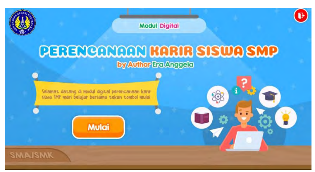
Figure 1. Example of a digital module cover

well; they do not have much information about careers, be it about high school or specialisation in education and work. This is what underlies the need for assisting students in planning their careers (Rosmana et al., 2019). This research is focused on the application of digital modules to improve career planning of junior high school students. Figure 1 shows an example of a digital module page used in this study.