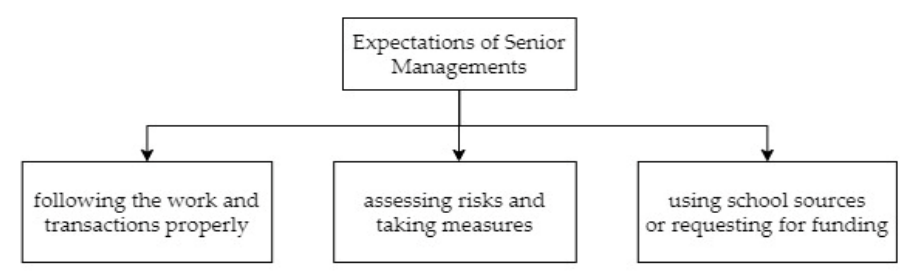
Figure 2. Themes for Expectations of Senior Managements

Participants discussing topics such as training, seminars, audits, and technical support related to OHS formulated the following demands: "We demand more training at OHS" (P5, elementary school), "Continuous monitoring and technical support are needed" (P7, elementary school), "Seminars and courses for OHS can be offered as part of in-service training" (P6, secondary school), "Relevant training and audits should be conducted with health and safety experts" (P14, high school). Noting a similar situation, one participant (P16, secondary school) stated: "... at the same time, the number of occupational safety specialists should be increased and expert visits to schools should be more. OHS experts should raise the awareness of our staff by giving frequent seminars."