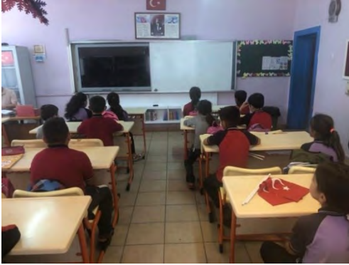
Photo 1. Classroom and Students

The research was conducted in December 2021 and January 2022. In the fourth-grade of an Alanya primary school, a seven-week application was submitted. The school is heated with a heating system. The school has 628 students enrolled. Both experimental and control group students are located on the school's first floor. The classroom is a bright environment. A smart board is present in the classroom. Students are seated in the configuration depicted in Photos 1 and 2.