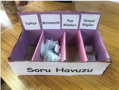
Photo 3. Question Pool

The treatment was administered to primary school fourth-grade students. The students carried out peer teaching activities and practices. In these applications, the teacher managed the process. It enabled students to perform peer teaching on a regular basis. Where necessary, corrections and contributions were made by the teacher. Researchers provided consultancy services to primary school teachers during the experimental process. In the experimental process, a box was prepared by the researchers. Above this box is written "question pool". The box is divided into four parts. In these sections, "Turkish", "Mathematics", "Science", and "Social Studies" are written. Students throw a question that they cannot do into the required lesson section in the question pool. The student writes his/her name under it while throwing the unfamiliar question into the box. Then, the student who can solve these questions explains how to solve the question to his friend who cannot solve the question. Photographs of the experimental process are presented in Photo 3, Photo 4, and Photo 5.