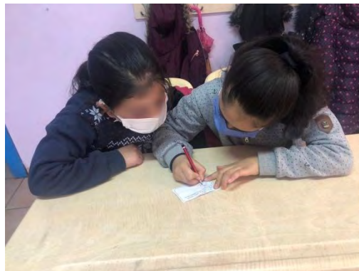
Photo 5. Peer Teaching