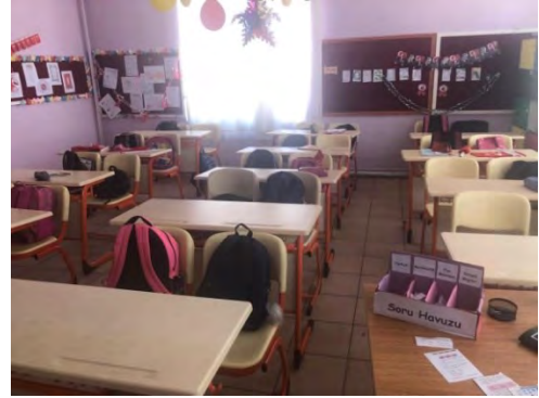
Photo 2. Classroom

The treatment was administered to primary school fourth-grade students. The students carried out peer teaching activities and practices. In these applications, the teacher managed the process. It enabled students to perform peer teaching on a regular basis. Where necessary, corrections and contributions were made by the teacher. Researchers provided consultancy services to primary school teachers during the experimental process. In the experimental process, a box was prepared by the researchers. Above this box is written "question pool". The box is divided into four parts. In these sections, "Turkish", "Mathematics", "Science", and "Social Studies" are written. Students throw a question that they cannot do into the required lesson section in the question pool. The student writes his/her name under it while throwing the unfamiliar question into the box. Then, the student who can solve these questions explains how to solve the question to his friend who cannot solve the question. Photographs of the experimental process are presented in Photo 3, Photo 4, and Photo 5.