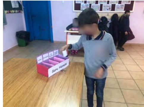
Photo 4. Student