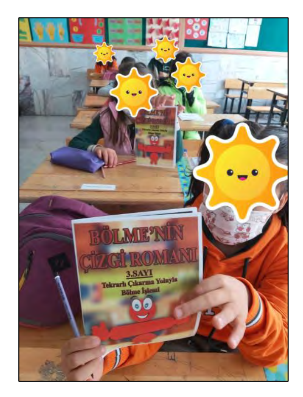
Figure 2. Example of Comic Book Page