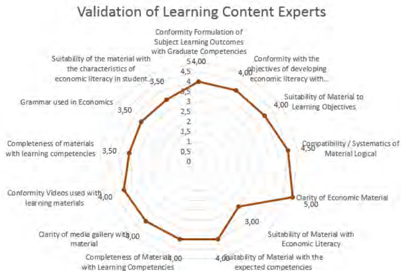
Figure 2. Expert Validation Score of Content Economic Literacy Material

in learning. With the highest score in the material wrinkles logically and the lowest was the grammar used in literacy in both categories to be continued for the next stage (see Figure 2).