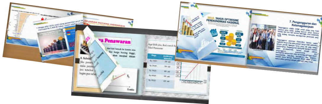
Figure 1. Economic and Financial Literacy E-book

Media development at this stage produces effective learning media. The e-book media that has been compiled is developed based on suggestions for improvement from the validator. The steps at this stage are validation, revision, product trials, and further revisions.