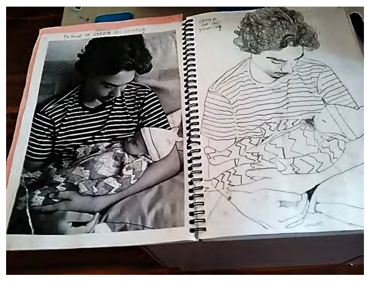
Fig. 8: Caring for family. (Photograph of student Visual Art Diary. Photograph by Shirley Clifton, November 1, 2017)

The photograph selected for the portrait was carefully chosen to show a deep sense of caring. It privileges the importance of family relationships and reflects the student's cultural values.