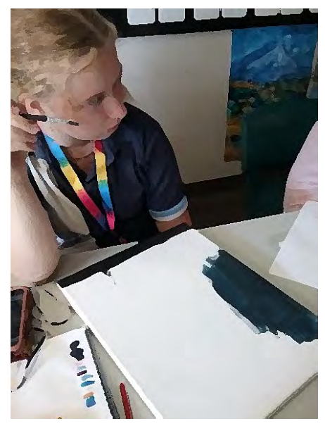
Fig. 3: Reflecting inner feelings in artmaking. (Photograph of students in the VA classroom. Photograph manipulated for the purposes of participant deidentification. Photograph by Shirley Clifton, February 20, 2019)

Shaniya expanded on this reflection referring to another image from their VAD. The image chosen was the head and shoulders of a female figure with a rose in place of the mouth and thorns twisting down around the neck of the figure (Figure 4).