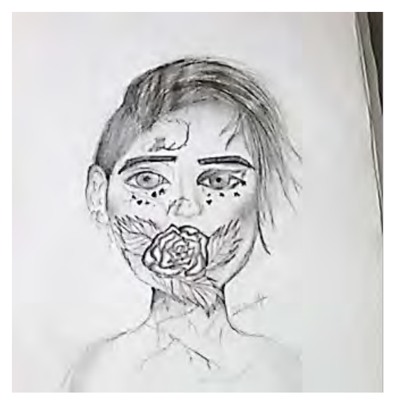
Fig. 4: Couldn't speak. (Photograph of student Visual Art Diary. Photograph by Shirley Clifton, February 20, 2019)

And I always felt like I couldn't say anything, because I thought it was normal. I thought, like, the fighting was normal, the screaming and yelling every night was normal. And then when I came to school, it was all different. I'm, like, well, it seems like I am the only one that suffers this? So, I always felt like my mouth was overgrown with stuff that I couldn't say. That's why there's a rose growing out of her mouth. (Student interview, October 9, 2020)