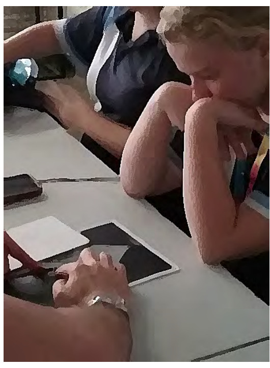
Fig. 7: Finding the shadows. (Photograph of student and teacher in the VA classroom. Photograph manipulated for the purposes of participant deidentification.)

In the image the despondency of the student is visible, but the teacher honours the lived experience of the student knowing that the artmaking journey is as much about articulating and resolving personal dilemmas as it is about making a resolved artwork. He is explicitly showing the student how to identify the shadows and light source of the source photograph, gently persisting until they understand.