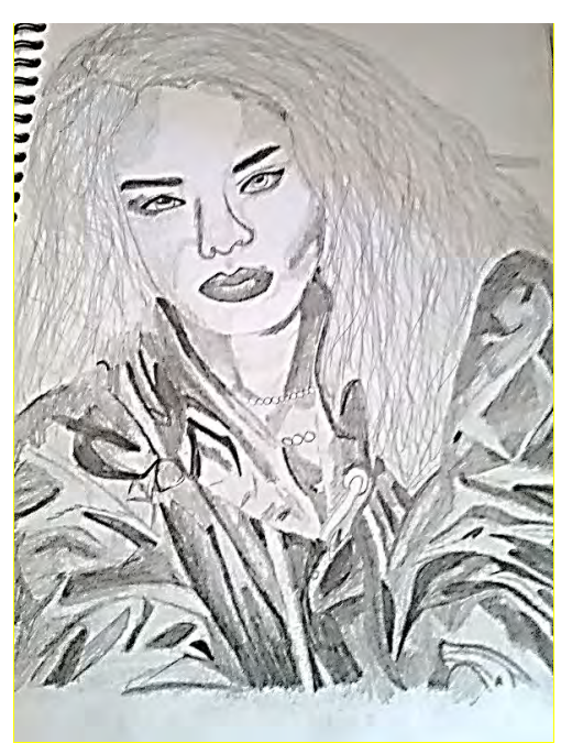
Fig. 6: Intersection of memory and medium. (Photograph of student Visual Art Diary.)

Researcher: So what made you proud of it?