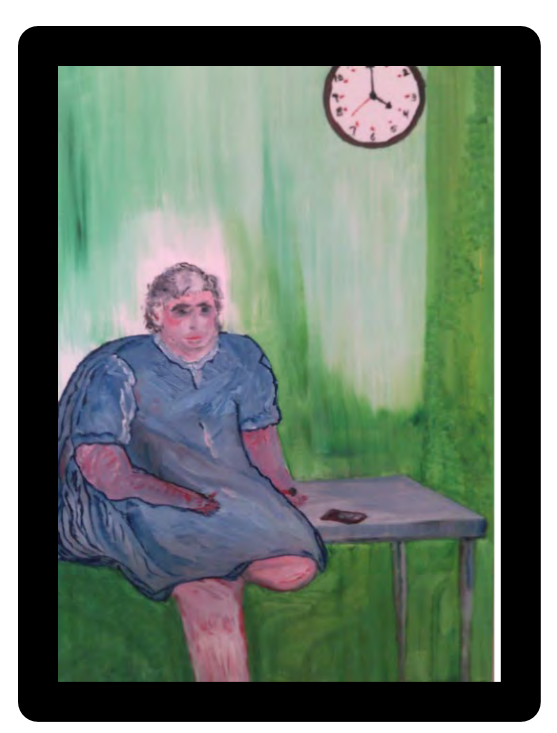
Fig. 6: And worrying... (Oil painting).