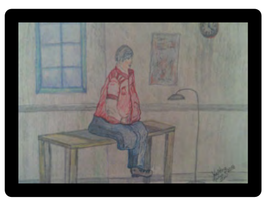
Fig. 5: Waiting... (Coloured pencil on toned paper).

In Janet's reflexivity journals, this individual is waiting to possibly hear devastating news (see Figure 5). He represents clients who have lost one limb and who are at risk of losing a second limb within five years; he may or may not know the statistics are against him (Botros et al., 2021).