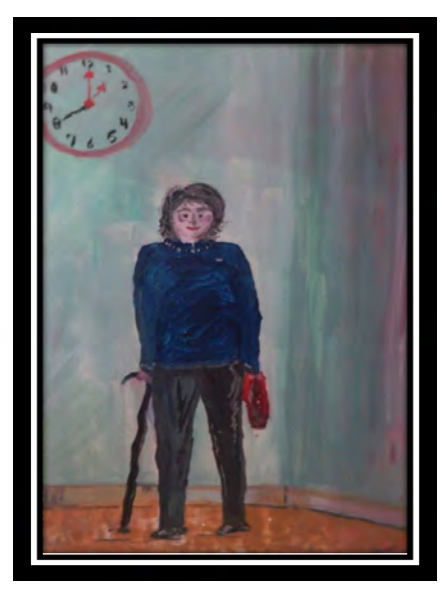
Fig. 1: I'd rather be working (Oil on canvas).

I painted the woman standing tall to remind me to keep participants' voices at the fore-front of the synthesis. I don't want their stories to get lost in dense, word only, texts. Framing the painting adds permanency to her voice; it is bounded. I have hung the painting in my office as a constant reminder that foot ulcers are a shaping influence on the mental and spiritual stories clients share. (Journal entry, March 17, 2018)