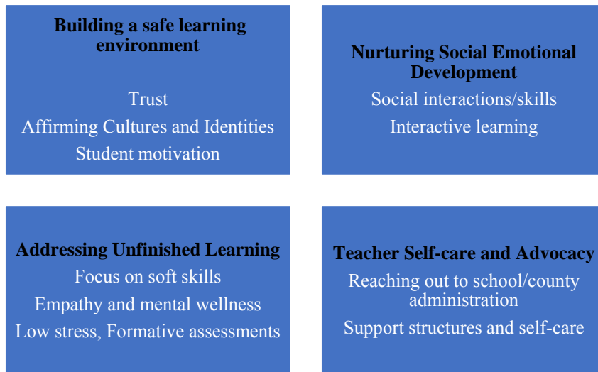
Figure 1. Experiences of Novice Teachers During the Pandemic

shown in Figure 1. Below we elaborate on each one of these themes to showcase teachers' insights on the student learning needs, what worked for them, and the challenges they faced in impacting student learning and development. Each theme had categories that we also expand upon in the following sections.