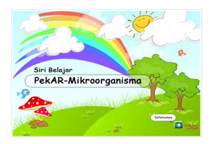
Fig. 2 The Introduction of PekAR-Mikroorganisma