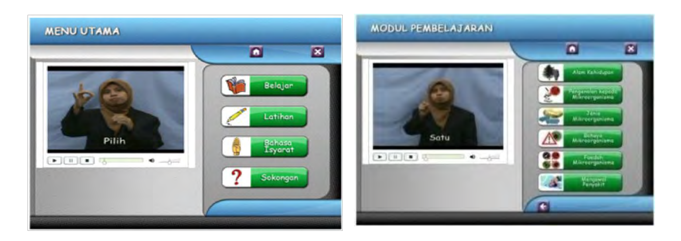
Fig. 3 The Main Menu and Learning Module of PekAR-Mikroorganisma