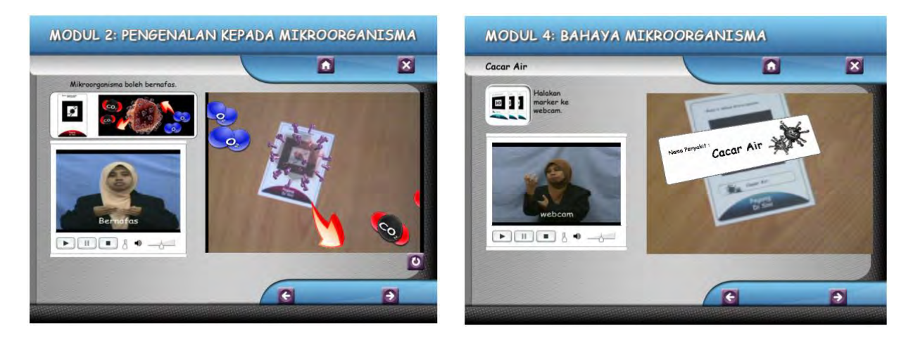
Fig. 4 Example of AR environment in courseware in module 2

The first screen in the courseware is the main display screen which can be seen in Fig. 2. The display starts with the name of the application which is PekAR- Mikroorganisma . "Pek" stands for Pekak or in the Malay language it means the hearing impaired. "AR" is augmented reality and Mikroorganisma means Microorganism. A multi-coloured interface with pictures of mushrooms was