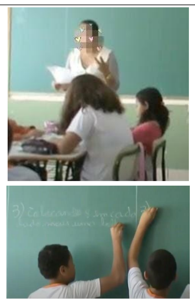
Figure 2. Description of Episode 7, in the TL

The teacher invites representatives of four groups to present their solutions and asks them to justify their strategies. The first student explains that his group got to answer 17 because they saw that figure 3 had 7 beads, so they increased by twos until they got to figure 8. The second student shows that they performed the operations "8+8=16, 16+1=17", explaining that this "one" is the black bead. The third one exposes that "8 on each side with the black bead gave 17", explaining that the figure number is the same as the number of white beads on each side of the necklace with the black bead in the middle. The fourth student registers the result on the blackboard and explains that "if each side has 8 white beads, the result is 16, plus the black bead, it equals 17".