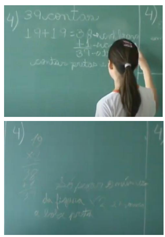
Figure 3. Description of Episode 8, in the TL

The teacher invites representatives of four groups to present. The first student reports that starting from the total of beads in figure 8 (task's previous question), they added by twos until they got to figure 19, and that this was performed in a table. The second one states that they calculated "2x19, 38+1=39". The third student shows that they calculated "19+19=38, then 38+1=39", explaining the meaning of each component: "19 is the figure number (position) and also the number of white beads on each side of the necklace and that the "+1" is the addition of the black bead". Focusing on the two previous resolutions, the teacher questions the class about what is similar and what is different between them. Then, the fourth group's representative presents his resolution in natural language: "we took nineteen on each side, and we added, and the result was thirtyeight. Then, we added the black bead, placing the plus one, giving thirty-nine".