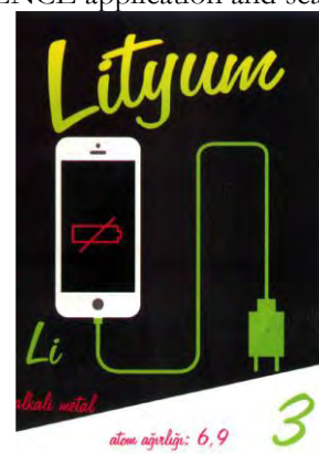
Figure 2 Sample page from the brochure prepared for the AR application

To see the atomic structure of the hydrogen element, run the AR SCIENCE application and scan the card.