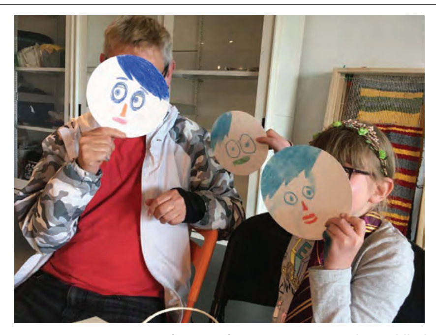
Figure 1: Post-screening activities for My Life as a Courgette at the Middlesbrough Institute of Modern Art