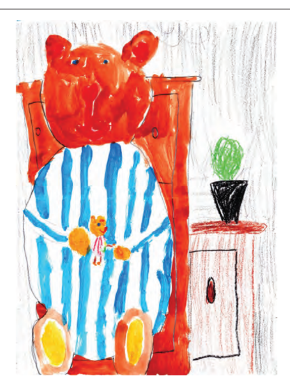
Figure 4: A primary school child expresses the friendship of Ernest and Célestine

Teachers found that using visual language and aspects of role play helped children express their own feelings. For example, one primary teacher asked their first-grade students to each play Paddington in a situation where the character was sitting alone at the railway station. The students felt what it is like to depend on others who are passing by, and talked about these feelings in class.