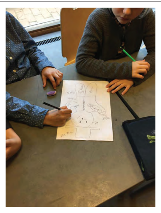
Figure 3: Post-screening activities to characterize Paddington