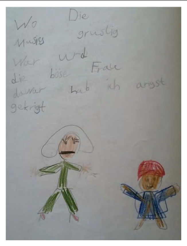
Figure 8: Primary school child's commentary on the Paddington screening: 'When the music was spooky and the mean woman showed up, I got scared.'

Teachers noticed challenges relating to film content: many secondary school students stated that they did not understand the issue and historical context of 'strike-breakers' in the British miners' strikes of the 1980s in Billy Elliot. Students, and also teachers, were not prepared for the issue of sexuality in My Life as a Courgette and in Billy Elliot. Especially from fifth-grade students, there were rejections of some scenes with sexual content during the screenings. One teacher remarked: 'The boys and girls in the cinema got really excited and asked: "Is the film really suitable for our age?" And they found that a bit disgusting."