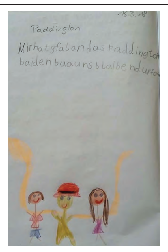
Figure 6: Primary school child's commentary on the film Paddington: 'I liked it that Paddington was allowed to stay with the Browns.'

In addition, teachers found that children were able to compare the immigrant background of a character such as Paddington with their own, and could very much understand the fears of arriving in a new country (in one instance, a boy from Syria who spoke little German was able and willing to share his background). Students learned how film is able to express particular perspectives through certain angles and 'point of view' shots, and were thus able to think about perceptions of self and other, stereotypes and prejudices. For example, secondary school students who seemed to have fixed opinions about the question of what is special about being a boy or a girl reflected on their thoughts after they explored the character of Billy Elliot, as a teacher describes: