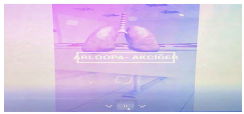
Figure 3. Integration of content into real environment with Arloopa AR application (I)

Within the scope of the course, students developed an application using the Arloopa AR application within the framework of the unit of science and health. In this research, students integrated the lung, an organ from the human body, into the virtual classroom environment with the Arloopa AR application. In this study, the lung image/digital content was integrated into the classroom environment with the ARLOOPA augmented reality application.