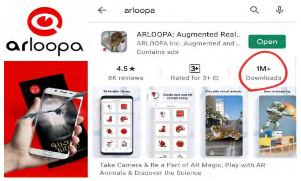
Figure 2. Arloopa Augmented Reality App

Within the scope of augmented reality applications in education course, students were asked to choose a lesson unit example and the integration of this unit into the classroom environment with the Arloopa augmented reality application was requested from the student groups.