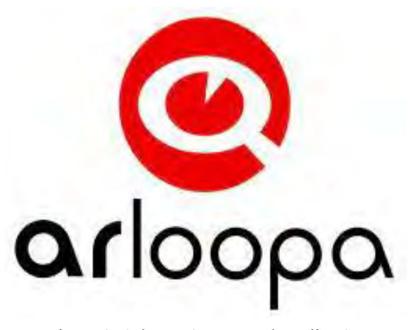
Figure 1. Arloopa Augmented Reality App

When augmented reality is mentioned, it is often meant to transfer virtual objects and information from the real world onto images in real time. This technology creates an artificial environment by adding virtual data on top of the real world. Many developer companies have produced augmented reality applications, opening the technology to different application areas and enabling it to appeal to a wider user base. One of these applications is ARLOOPA. ARLOOPA is an augmented reality and virtual reality app which provides advanced AR services that lets people impose digital content (images, sounds, text) over a real-world environment.