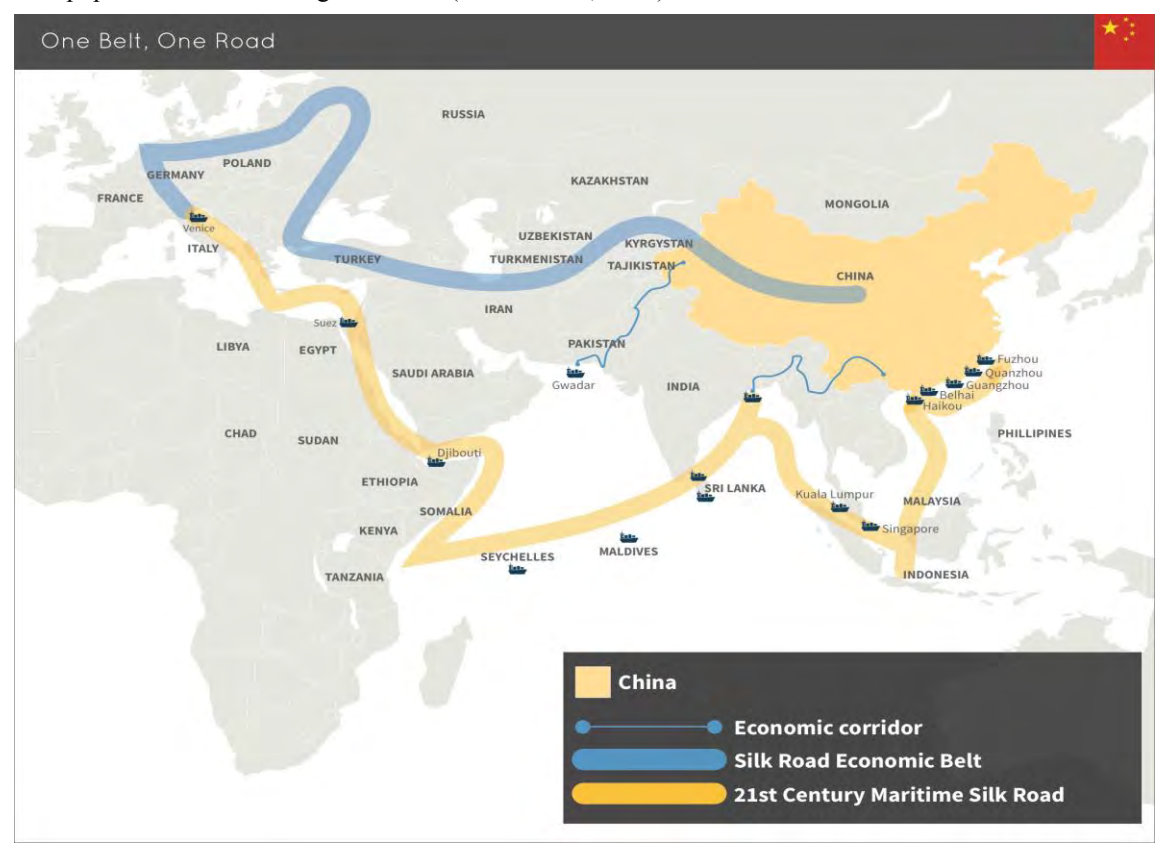
Figure 1. The map of Chinese Belt and Road Initiative

According to Alicia and Xu (2016), the "Belt and Road Initiative" is undoubtedly the most important international blueprint that China has embarked on in recent years. Its purpose is to promote the economic development of the region covering Europe, Africa and Asia. Some official announcements indicate that this Initiative involves 63 countries, including 18 European countries, although there are no official documents on which countries to be include. Particularly relevant to Europe is that the road ends at the beginning of the European Union (EU). Most importantly, the huge trade between the EU and China represents 64% of the world's population and 30% of global GDP (Alicia & Xu, 2016).