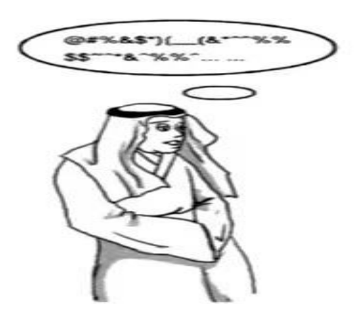
Figure 3 P. 145