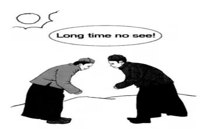
Figure 1. P. 153

Except the mentioned above, another discourse strand showing linguistic imperialism is the fallacy that everyone can speak English, not just in America, but around the world. "In the United States, for example, people expect that newcomers will speak English" (P. 283); schools in India are assumed to teach English (Case study 1, P. 6); even the ancient Chinese greet each other in English instead of Chinese as shown the following picture.