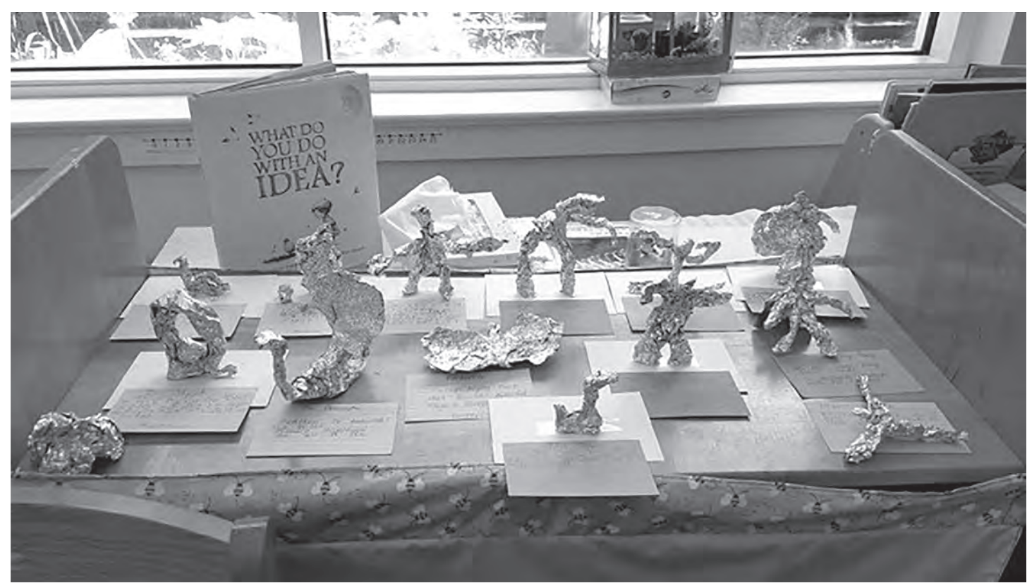
Figure 5. Creative play products created by students after reading What Do You Do With an Idea?

Sometimes, the youngest children might need the play to be the only product for their composition. However, older children will be able to turn their compositions into dictation, drawings, and writing. "What is clear is that most children, when learning to write, already know a great deal about how to construct texts. The problem is that too often the trials and tribulations of learning to hold pencils, writing letter shapes, and rendering sounds into symbols create a distance between learning to write and being able to compose"