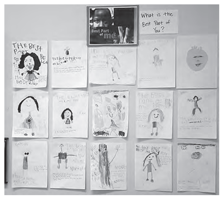
Figure 4 . Thinking about materials for The Best Part of Me play center.

Can you apply this idea to a book like The Best Part of Me: Children Talk About Their Bodies in Pictures and Words (Ewald, 2002)? Think about the materials needed to support the question "What is the best part of you?" (see Figure 4). What materials would children need to explore this idea and begin to compose their own answers through play?